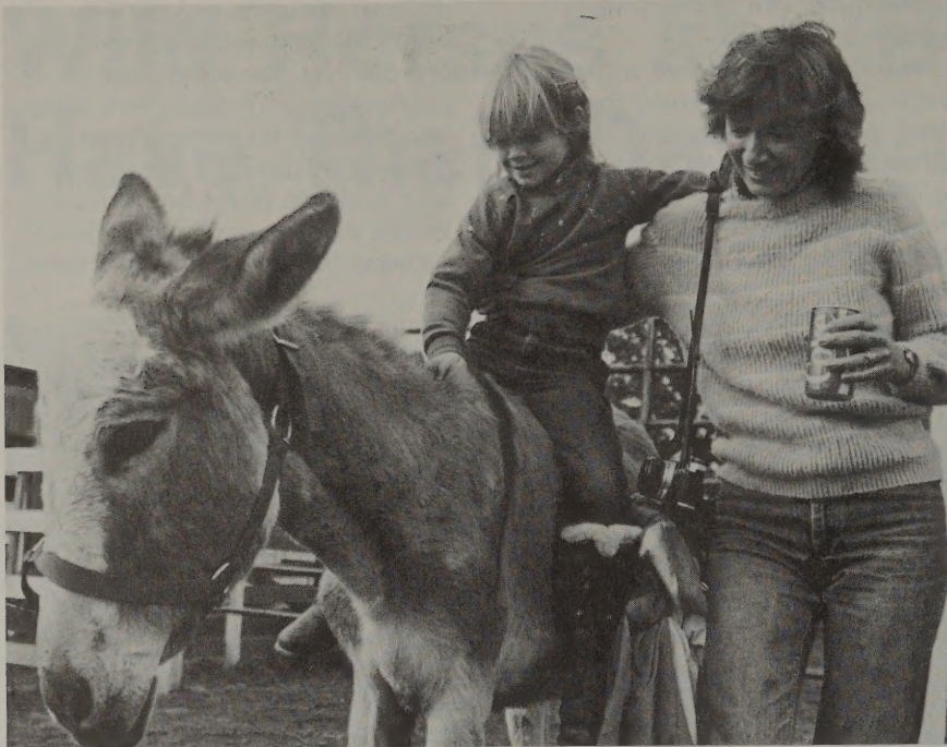
Visiting children delight in riding tamed wild horses and burros.

of animals after adoption circulate from campfire to campfire, almost like photos of grandchildren at a family reunion.